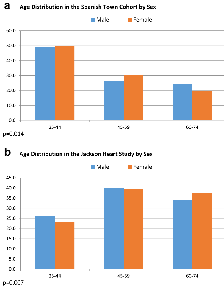
Fig. 1 Age Distribution in the (a) Spanish Town Cohort Study and in the (b) Jackson Heart Study by Sex