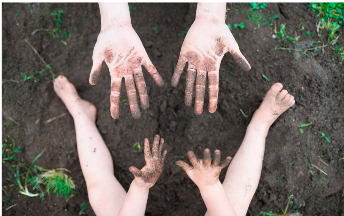
Early exposure to microbes has important health effects, leading many researchers to question the value of the "hygiene hypothesis" label.