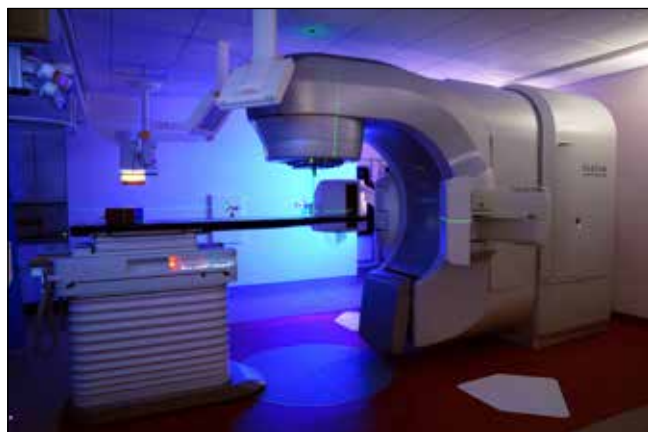
Fig 1. A linear accelerator for EBRT