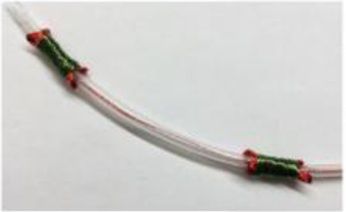
Fig. 1. MRI-actuated catheter with two sets of actuation coils.