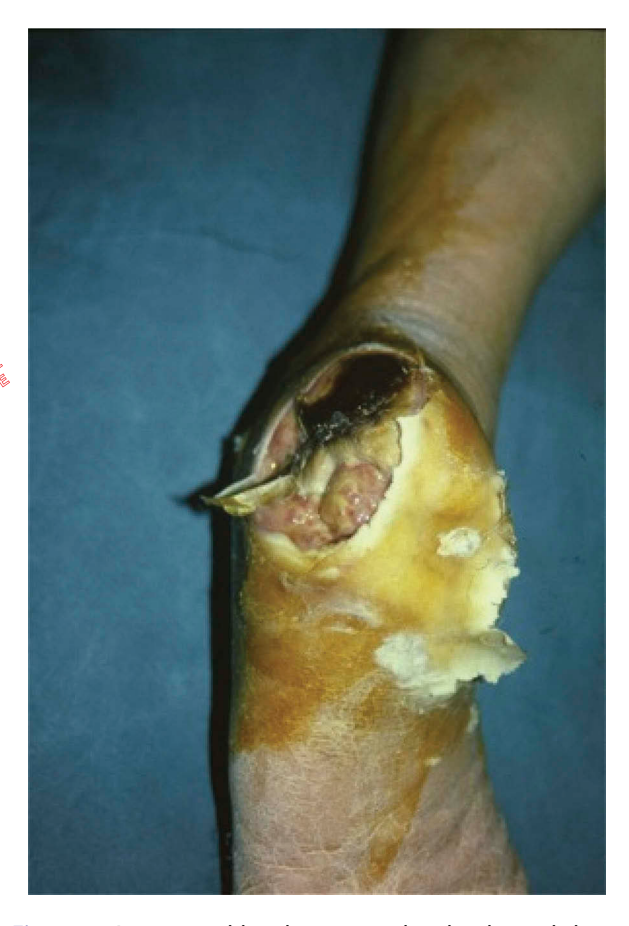
Figure 2. A 72-year-old male presented with a large diabetic foot ulcer over the left heel.

(Figures 3 and 4). The pin site infections were defined as minor or major according to the Checketts– Otterburn classification [11]. The external fixator was removed after a mean of 8.2 weeks (range 7–10 weeks) and a custom-made ankle–foot orthosis with a soft inner foam lining and a dense outer foam heel was ordered.