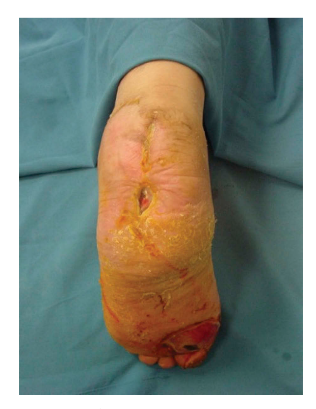
Figure 4. Plantarflexion was gradually decreased and the external fixator was removed in the postoperative 8th week. Clinical outcome with an uneventful recovery.