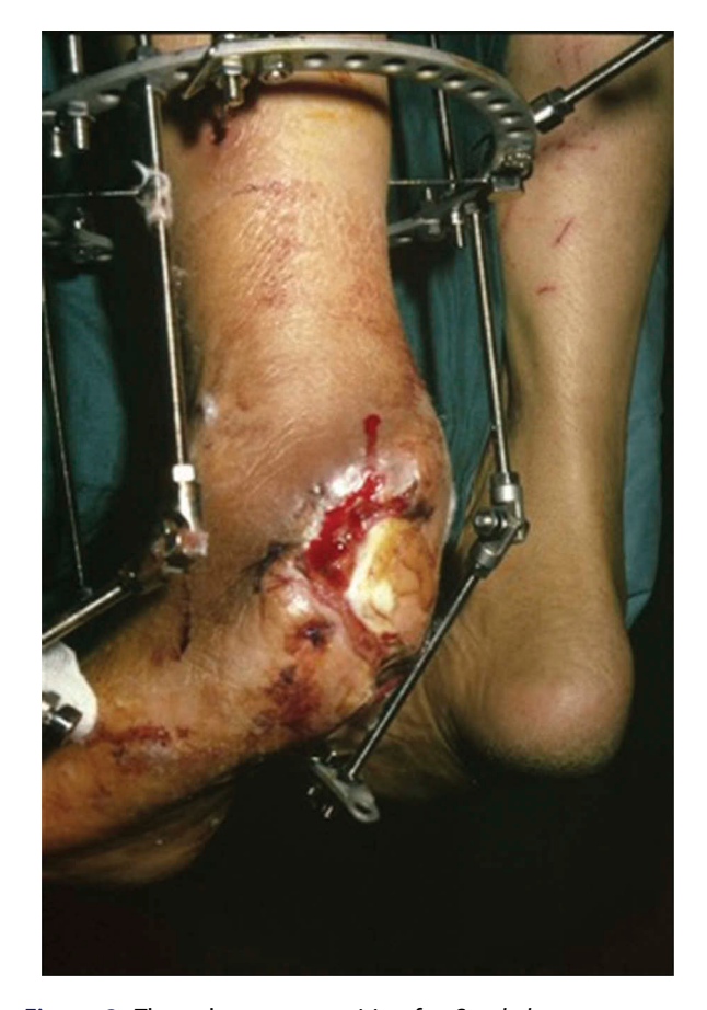
Figure 3. The culture was positive for Staphylococcus aureus and Pseudomonas aeruginosa . After surgical debridement and partial calcanectomy, an Ilizarov external fixator with hinges was applied to decrease the soft-tissue defect in the equinus position.

The outcome data are presented in Table 1. Wagner grade II pedal ulcer was determined in 11 patients and Wagner type III in 12 patients. Of these, osteomyelitis was diagnosed in 17 patients. Preoperative evaluation of the extent of the infection almost totally