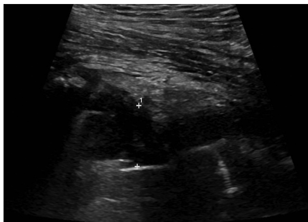
Fig. 2. Ultrasound scan of the right hip showing a hip joint collection with a depth of 18 mm.

On physical examination the only pertinent physical findings were that he had a temperature of 38.5 °C with a swollen and erythematous right hip joint. His blood results on admission showed C-reactive protein (CRP) 12.9 mg l -1 , white blood cells 17.6 × 10 9 l -1 , and neutrophils 16.11 × 10 9 l -1 . A blood culture taken on the day of admission did not grow any organism. An ultrasound-guided aspirate of his right hip (see Fig. 2) revealed thick purulent fluid. Empirically benzylpenicillin (1 g every 6 h) and flucloxacillin (2 g every 6 h) were started. The direct Gram stain showed many pus cells and Gram-positive cocci in chains. The isolate did not grow on blood and chocolate agar, but did grow on anaerobic plates and was identified as Granulicatella