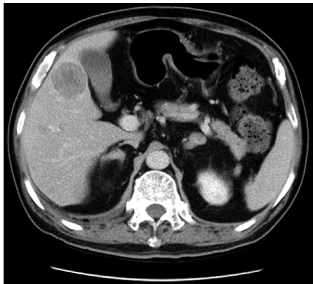
Figure 3 Bilateral adrenals nodules, considered metastases.

the exclusion of other causes of CS, histopathologic findings, and clinical improvement after chemotherapy.