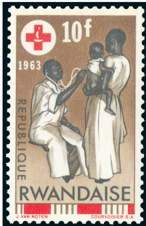
A stamp published in Rwanda in 1963 by International Red Cross emphasising the importance of stethoscope