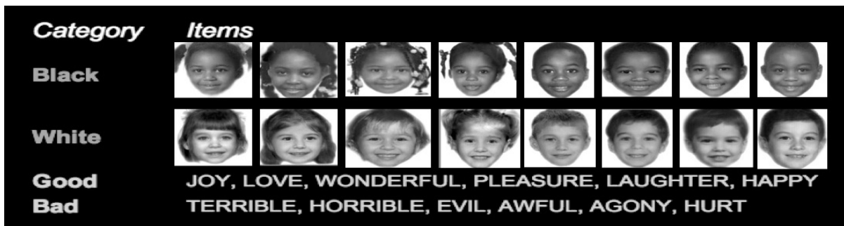
Fig 2. For the Child Race Implicit Association Test (IAT) participants categorize pictures of black and white child faces while simultaneously categorizing good and bad words. The IAT measures the strength of association between the category of faces (black, white) and the category of words (good, bad) using response latency time and frequency of errors.