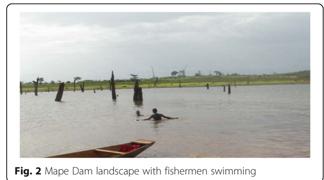
Fig. 2 Mape Dam landscape with fishermen swimming

Risk factors documented in the four schools surrounding settings included the lack of hygiene and sanitation, ignorance and lack of knowledge of the disease and the tropical ecology (relative temperature: 22–28 °C, preferable sites of the snail sample at depth of water root and stem or death leaves of 20–30 cm), that favour the development of snail intermediate host. The intermediate host of S. haematobium documented belongs to the family of Bulinidea, genus Bulinus made up of four subtypes namely: africanus , tropicus , truncatus , forskali . Also, the development of hydroelectric and agricultural policy and practice in the areas also provided another favorable biotic environment for snail development and infestation. Continuously, fishermen and farmers have been exposed to such infestation since the works involve permanent and frequent contact with water of unknown risks and determinants, requiring urgent implementation of community-based schistosomiasis risk factors surveillance and targeted interventions such as mhealth schistosomiasis strategies innovations in behavioural changes coupled with improved communities (WASH) water, sanitation and hygiene programs benefits.