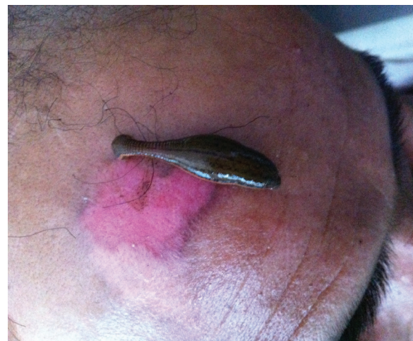
Fig. 2: Application of leech on chronic non-healing ulcer.

minor injuries– there is always danger of rapid multiplication of bacteria. The elderly and persons with reduced immunity are at great risk for wound-related infections. Once bacteria escape from the primary location of a wound, they enter the blood. This condition is commonly called blood poisoning, septicemia, sepsis, or septic shock. Sepsis is always a serious, life-threatening condition, with 56% mortality. In the United States, sepsis occurs annually in some three cases per 1,000 population. In sepsis and septic shock, circulation is reduced; blood pressure is markedly reduced, causing vital organs to receive reduced blood supply; heart, kidney, and liver functions are reduced or show signs of shutdown (multiple organ failure); and abnormal bleeding can develop. Symptoms of septicemia and septic shock are sudden onset of illness, high fever, chills, rapid breathing, headache, and altered mental state. 38,39 Zaidi (2016) reported an option in treatment of poorly healing wounds with hirudotherapy (Figure 2-4). 40