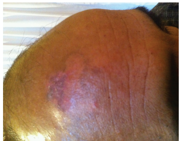
Fig. 3: Partially healed chronic ulcer.