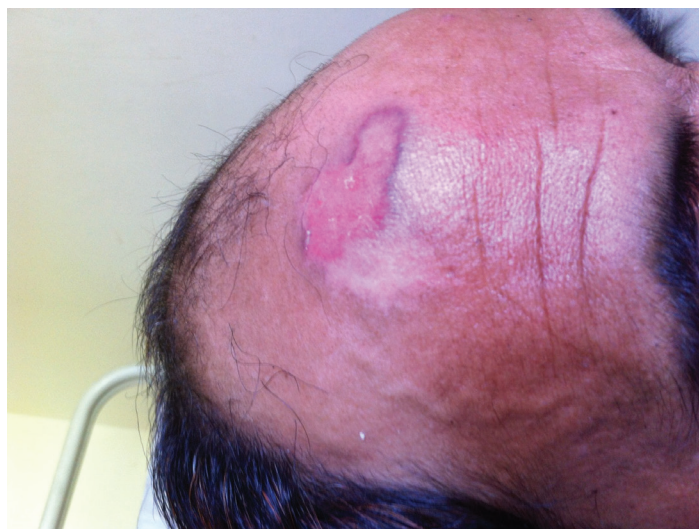
Fig. 1: Chronic non-healing ulcer on forehead.

All wounds heal in three stages: (i) Inflammatory Stage, occurring during the first