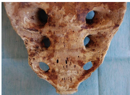
Figure 1 Sacrum specimen. Multiple sacral basivertebral vein foramin, between 2-4 mm, are seen on S4-S5.

sacral plexus in the lithotomy position is approximately twice the venous pressure of the inferior vena cava in the supine decubitus position, and injury to a vein with diameter between 0.5 mm and 4 mm can cause blood flow of 32 mL/min to 1994 mL/min [4,5] .