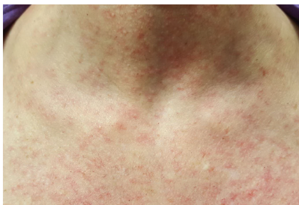
Fig. 1. Maculopapular rash over neck and trunk.

On day 5, laboratory studies were performed and revealed a white cell count of 2800 \text{ mm}^{-3} (normal range: 4000\text{--}10\,000 \text{ mm}^{-3} ) with 56% neutrophils, 38% lymphocytes and 1.1% eosinophils (normal range: 40–80%, 20–40% and 0–8% respectively). Haemoglobin and