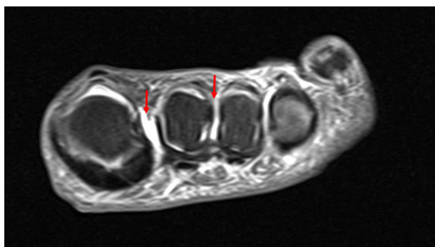
Fig. 3. T-2 weighted magnetic resonance imaging of the left foot without contrast showing trace fluid in the intermetatarsal bursae between the 1st and 2nd metatarsal heads and 2nd and 3rd metatarsal heads (red arrows).