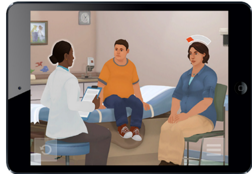
Figure 2 Screenshot from Together Strong : where veterans and military personnel learn how to support their buddies exhibiting signs of post-deployment stress and motivate them to seek help.

in the “Guardian of the Golden Gate Bridge”, convinced more than 200 people not to take their lives by jumping from the bridge. He recounted one survivor stating: “ He never made me feel guilty for being in the situation I was in. He made me feel like, ‘I understand why you are here, but there are alternatives’. ” (2).