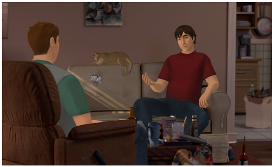
Figure 4 A screenshot from At-Risk for Students , a mental health simulation where students learn how to speak with and motivate fellow students experiencing psychological distress to seek help.

neutral appearance, are not subject to trainer bias, and will continually respond in the most efficacious way to promote skill development. Also, users find it easier to talk to and explore different communication strategies with virtual humans as there is little fear of making mistakes or being judged, especially when practicing in the privacy of one's home or office (12). Lastly, the appearance and voice/language of the virtual human can be customized to each user and conversation setting to provide a high level of personalization, localization, and cultural appropriateness. These factors make digital simulations appropriate alternatives or supplements to traditional workshops and other non-interactive learning experiences.