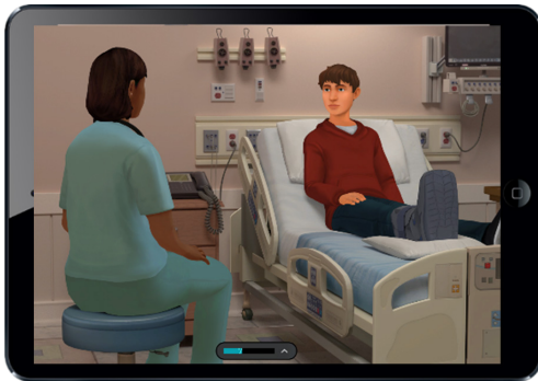
Figure 1 Screenshot from At-Risk in Primary Care : Adolescent where healthcare professionals learn to conduct screening and brief interventions with adolescents at-risk for mental health and substance use disorders.