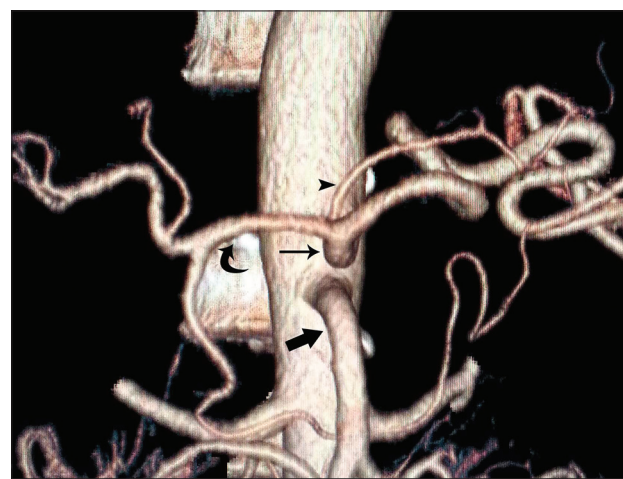
Figure 1: Volume-rendered image showing normal anatomy of celiac trunk ([thin arrow], superior mesenteric artery [thick arrow], left gastric artery [arrowhead], common hepatic artery [curved arrow])

During human embryogenesis, four roots of omphalomesenteric artery arise from abdominal aorta and are interconnected by a ventral longitudinal anastomosis. Two central roots of these four aortic branches disappear during embryogenesis and the first and fourth root