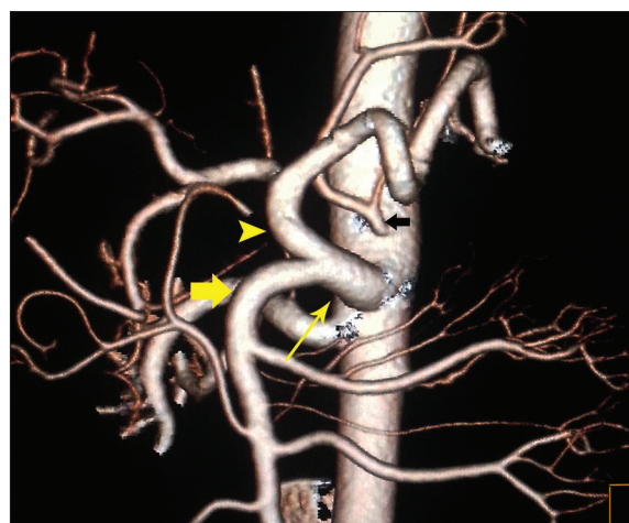
Figure 3: Volume-rendered image showing common trunk (thin yellow arrow) of the celiac artery (arrowhead) and the superior mesenteric artery (fat yellow arrow), also notice to the left gastric artery directly off aorta (black arrow)