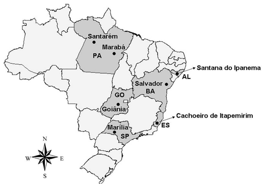
Fig 1. Brazilian political map showing the states where collections were performed.

2) Insecticides—Temephos (PESTANAL ® - 95,6% temephos a.i., Sigma–Aldrich) and liquid spinosad (Natular ™ 20EC– 20.6% Spinosad a.i., Clarke Mosquito Control Products, Inc.) were used for laboratory assays. The insecticides were diluted so that a final concentration of 3000mg/L was achieved for both. After normalizing the concentration, we prepared the solutions for the bioassays. For the field simulations, one effervescent tablet of spinosad (Natular ™ DT– 7.48% Spinosad a.i., Clarke Mosquito Control Products, Inc.) was used per 200 L tank,