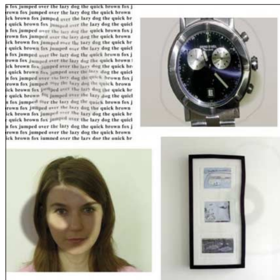
Fig 1 Images created by the patient showing the metamorphopsia, micropsia, and blurring experienced with the left eye.

Patients with disease of the visual pathway use all manner of ways to describe the sensory aberrations they are experiencing. An important part of an ophthalmologist's work is to try to gain a clear impression of a patient's symptoms, and the descriptions that are given often relate to the patient's background and culture. In particular, artists who have visual problems often report minute details and fluctuations in their vividly crafted interpretations of disordered function. Such observations often strongly correlate with the underlying pathophysiology of their condition. A 32 year old man presented to us with a left central serous retinopathy. He works as a graphic designer and was able to combine his professional and artistic skills to generate images showing us the symptoms he was experiencing. The subretinal fluid resolved over the subsequent few months, but he was left with some residual visual distortion.