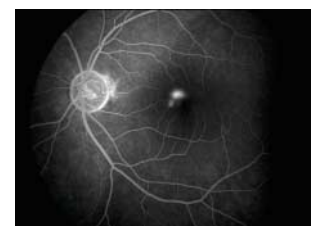
Fig 3 Fluorescein angiogram showing an inkblot appearance