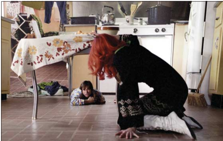
Jim Carrey's memories take a bit of a pounding in The Eternal Sunshine of the Spotless Mind thanks to one of those high tech memory erasing devices so beloved of moviemakers

niac (2002), and there are no holds barred in Uchu no Kishi Tekkaman Bureido (1994), in which an amnesic with no idea of his identity can nevertheless transform himself into "Teknoman," an unstoppable fighting machine. The arrival of an amnesic patient at a hospital coincides with the opening of the "Dead Pit" in the film of the same name, unleashing an evil doctor who clearly has not been keeping up to date with his medical education during his enforced incarceration in the vault.