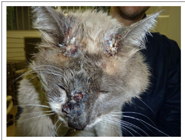
Figure 1 Ulcers on the face of cat 12

Cat 10 presented to the ER on Wednesday 5 October for dysorexia and exhaustion (no precise diagnosis was ever established). It was never hospitalised, but presented during the time when cat 5 was present. After 9 days, on Friday 14 October, it was admitted to the quarantine area for fever, lingual ulceration and icterus. The cat was euthanased on 27 October, 22 days after its first admission.