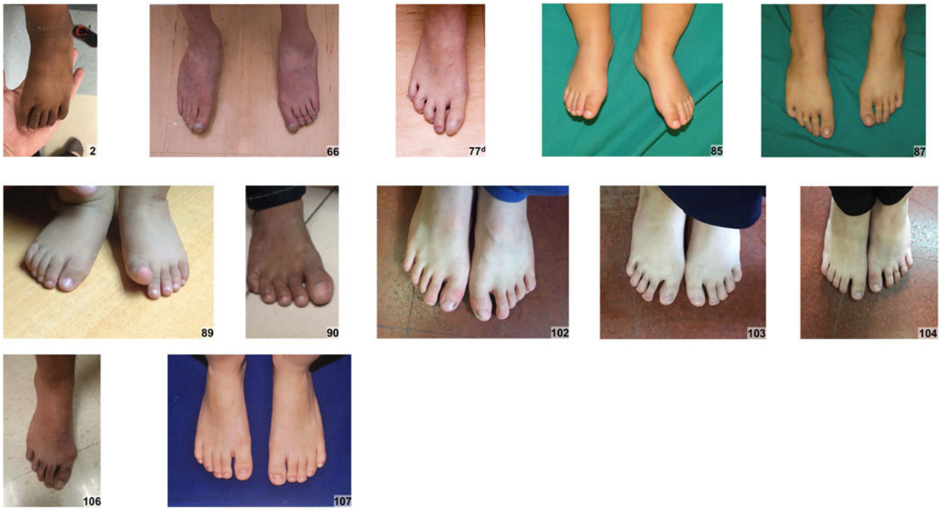
Figure 6. Foot findings. Image numbers correspond with Supplementary Table I. d Individual previously published in Liu et al., 2014