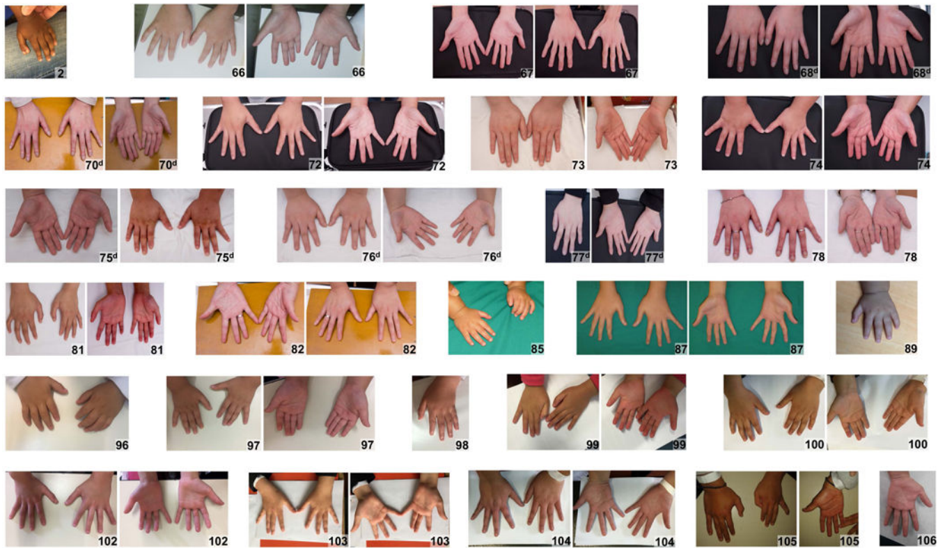
Figure 5. Hand findings. Image numbers correspond with Supplementary Table I. d Individual previously published in Liu et al., 2014