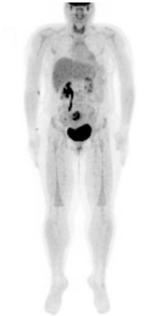
Figure 2 Surveillance PET-CT revealing uterine uptake, which led to diagnosis of stage I uterine leiomyosarcoma.

Abbreviation: PET-CT, positron emission tomography-computed tomography.