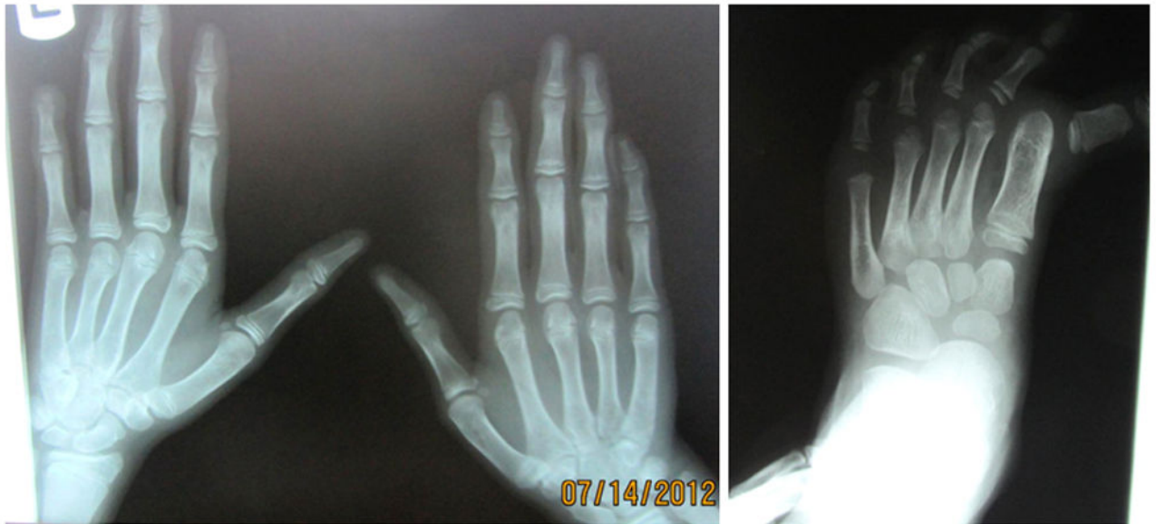
Figure 2. X-rays of left hand and foot. (a) Note hypoplasia of terminal phalanges and absence of terminal phalanx of fifth finger. (b) Note severe hallux varus before surgery.