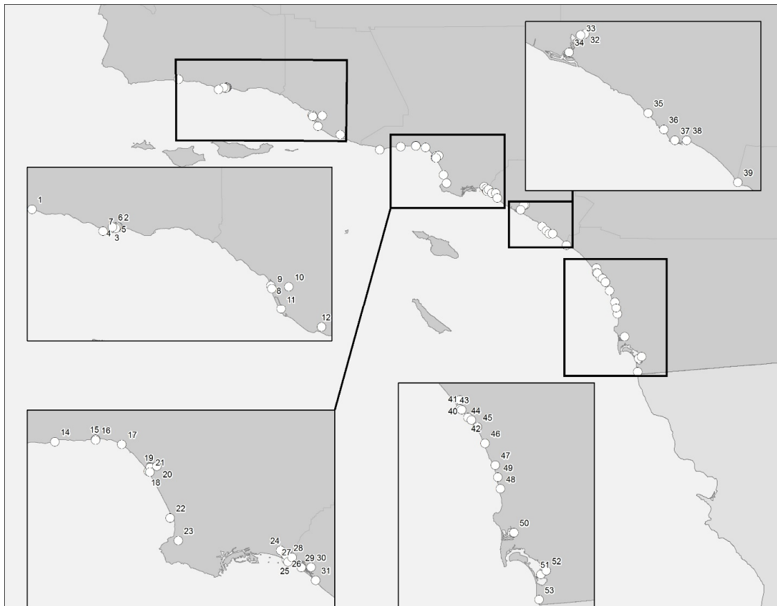
Figure 2. Map depicting fifty-three sampling locations along the Southern California Bight coastline. Santa Barbara and Ventura Counties (#1–12) 1 = Arroyo Hondo, 2 = Atascadero Creek, 3 = San Jose Creek, 4 = San Pedro Creek, 5 = Tecolotito Creek, 6 = Goleta Slough, 7 = Devereaux Slough, 8 = Ventura Harbor, 9 = Santa Clara River Estuary, 10 = Santa Clara River, 11 = Channel Islands Harbor, 12 = Calleguas Creek. Los Angeles County (#13–28), 13 = Zuma Lagoon, 14 = Malibu Lagoon, 15 = Topanga Creek, 16 = Topanga Lagoon, 17 = Rustic Creek, 18 = Ballona Lagoon, 19 = Marina Del Rey, 20 = Ballona Creek, 21 = Del Rey Lagoon, 22 = King Harbor, 23 = Malaga Creek, 24 = Colorado Lagoon, 25 = Alamitos Bay, 26 = Mother’s Beach, 27 = San Gabriel River, 28 = San Gabriel River upstream. Orange County (#29–39), 29 = Seal Beach, 30 = Huntington Harbour, 31 = Bolsa Chica Channel/Basin, 32 = San Diego Creek, 33 = Upper Newport, 34 = Back Bay, 35 = Aliso Creek, 36 = Salt Creek, 37 = Dana Point Harbor, 38 = San Juan Creek, 39 = San Mateo Creek. San Diego County (#40–53), 40 = Santa Margarita River, 41 = Oceanside Harbor, 42 = Loma Alta Creek, 43 = San Luis Rey River, 44 = Buena Vista Creek/Lagoon, 45 = Agua Hendionda, 46 = Batiquitos Lagoon, 47 = San Elijo Lagoon, 48 = Los Penasquitos, 49 = San Dieguito River, 50 = Mission Bay, 51 = San Diego Bay, 52 = Sweetwater River, 53 = Tijuana River/Estuary.

Cyanotoxin analysis was primarily conducted using ultra high performance liquid chromatography with HPLC-UV using an Agilent Infinity 1260. Separation was carried out with an Agilent Zorbax RRHD Eclipse Plus C18, 2.1 × 50 mm, 1.8 μm column (Agilent Technologies, Santa Clara, CA, USA). The method was adapted and modified from [57,73,74]. The mobile phase consisted of A: H 2 O, 0.01% TFA, B: MeCN, 0.01% TFA. The elution gradient began with 20% B from zero to 4 min, with a transition to 70% B by 4.2 min. This was followed by an increase to 95% B by 4.6 min and this was held until 5.4 min, with a subsequent decrease to 20% B by 6 min, and held for 1.5 min. The flow rate was 1 mL/min and the column was heated to 30 °C. Anatoxin-a and derivatives were considered ‘anatoxin positive’ due to lack of ion fragmentation patterns obtained from HPLC-UV