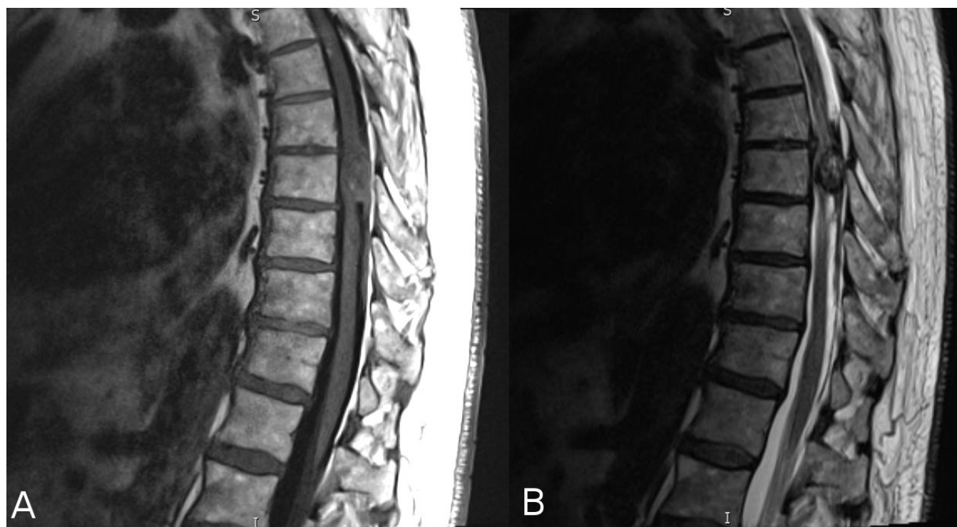
Fig. 1. Preoperative MRI of patient presenting with intradural hemorrhage. A. Sagittal T1 noncontrast sequence. B. Sagittal T2 sequence.

Hemorrhagic conversion of a spinal schwannoma is rare. Several reports have described the presence of intracranial subarachnoid hemorrhage in the setting of a distal spinal schwannoma. 4-7 Similarly few reports have described hemorrhagic conversion of spinal schwannomas presenting with spinal hematomas and related symptoms. 8-16 These reports have described hemorrhage from spinal schwanno-