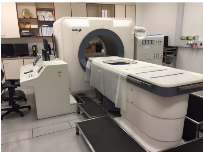
Fig. 1. Ultrasound-guided high-intensity focused ultrasound system.

Treatment centers vary in their protocols for patient assessment