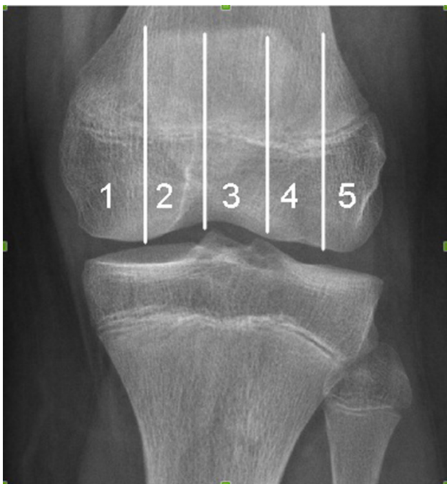
Fig. 1 Cahill and Berg 9 areas of the knee in anteroposterior projection: areas 1 and 2 are in the medial condyle, area 3 is the central zone bordered by the intercondylar tibial eminences, and areas 4 and 5 are in the lateral condyle.

The stability of the lesion was classified using the radiographs and MRI images, according to the criteria of Dipaol, Nelson and Colville. 10 Groups I and II are stable forms, while groups III and IV are considered to be unstable forms. 10-12