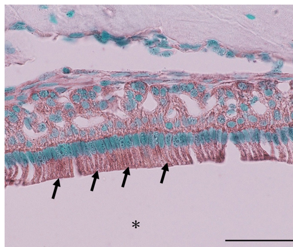
Figure 2 Expression of eNOS mRNA in the mouse lower incisor at 8 weeks of age by in situ hybridization. eNOS signals are detected in ameloblasts (arrow) at the maturation stage (asterisk: enamel). Bar, 50 \mu m.

Rat molars have been used in many studies that morphologically investigated the relationship between orthodontic treatments and NOS [38–40]. These studies demonstrated that the expression of NOS differed between tension and compression areas (pressure side). The expression of NOS in bone tissue has been attracting attention. When an orthodontic force (10 cN for 120 h) was loaded on the tension area (side) of alveolar bone, the number of eNOS-positive osteocytes started to increase after 24 h, and a small number of iNOS-positive osteocytes were also found to be present. In contrast, the number of iNOS-positive osteocytes in the compression area (pressure side) started to increase 6 h after loading the force, and that of eNOS-positive osteocytes also increased from 24 h. These findings suggested that osteocytes functioned as a regulator in tension and compression areas (pressure side), i.e., eNOS expressed by osteocytes in the tension area (side) acted as a regulator of bone formation while iNOS expressed in the compression area (pressure side) acted as a regulator of inflammation-induced bone resorption [39]. Another study [40] demonstrated that these actions as a mechanosensor in the tension (side) and compression (pressure side) areas were performed by periodontal ligament fibroblasts, not osteocytes.