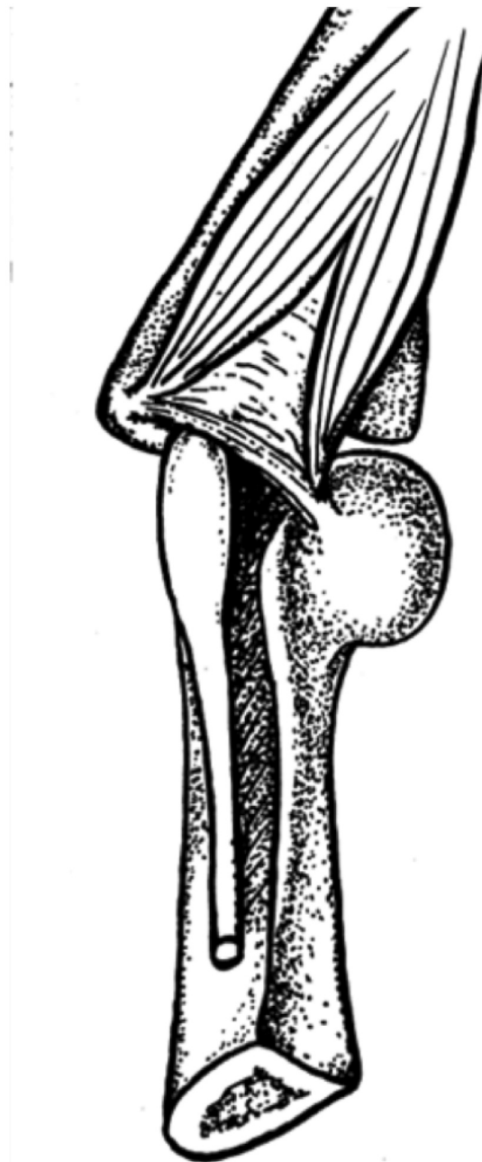
FIGURE 2: Drawing of Osborne's ligament

Note the entrapment site at the postcondylar groove with a pseudoneuroma of the ulnar nerve proximal to the ligament (Published with permission from [5]).