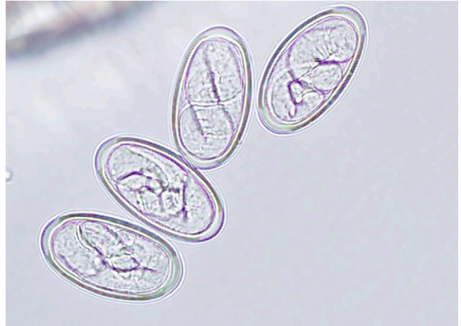
FIGURE 3. Embryonated eggs (50 × 25 μm) with smooth thick shells were noted both in utero and external to the specimen.

Published literature on Gongylonema human infections exist. Patients are described as having the sensation of an object moving in their mouth, and typically, as in this case, the patients remove the worms themselves. Removal of the parasite typically clears the infection. 10 All reported cases describe oral lesions as the major component in the clinical presentation. Nausea and vomiting are often not noted, 3-5 but some of the early case reports of Gongylonema infection did present with nausea. 11 The oral symptoms lasted 7 months. The nausea with vomiting persisted for 3 months suggesting that Gongylonema migrated into the esophagus. Although, endoscopic studies were not performed, the presence of Gongylonema from the esophagus of cattle and a donkey in