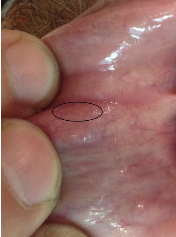
FIGURE 1. Oral lesion that migrated under mucosa in oral cavity.

trailer supports this, but the grains were discarded before analysis for Gongylonema could be done.