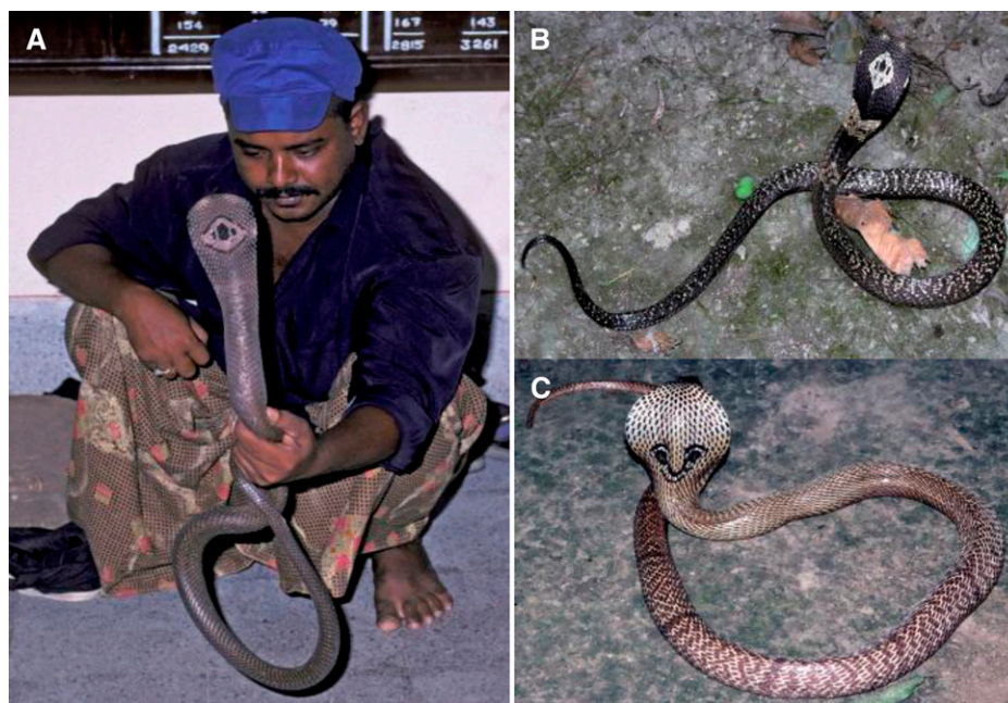
FIGURE 1. (A) Monocled cobra ( Naja kaouthia ) from southeastern Bangladesh with snake handler. (B) Naja kaouthia from Kolkata, West Bengal, India. Note the variation in the pattern of the monocular hood markings between A and B. (C) Spectacled cobra ( Naja naja ) from Kolkata, West Bengal, India, showing the distinctive “pair of “spectacles””.

administered to all patients exhibiting signs of advanced systemic neurotoxicity (e.g., bilateral complete ptosis, external ophthalmoplegia, dysphagia, dysphonia, weak grip strength, weak neck muscles, “broken neck” sign, or respiratory difficulty). Antivenom was not given to patients with minimal signs of neurotoxicity (e.g., partial ptosis with no other signs of systemic neurotoxicity) or to those with local signs of envenoming (e.g., blistering and local necrosis) in the absence of systemic neurotoxicity. Antivenom use conformed to Bangladeshi national guidelines: 100 mg of immunoglobulin in 100 mL vehicle was made up to 200 mL in 0.9% w/v NaCl as directed by the manufacturer and administered via intravenous infusion over a period of 1 hour. In the absence of any reversal of paralysis after 2 hours, the same dose was repeated. Infusion was suspended if a patient developed adverse responses (e.g., urticaria, anaphylaxis, severe pyrogenic side effects) before the infusion was completed. In that event, adrenaline (0.25 mg i.m.), (0.2 mg/kg i.v.), and hydrocortisone (2 mg/kg i.v.) were administered and the infusion of antivenom was resumed.