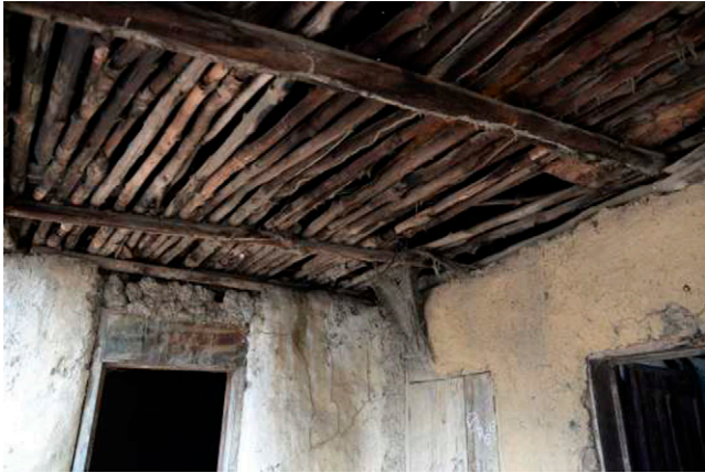
FIGURE 2. House ceiling made of aligned branches obtained from the forest.

woven with smaller branches (these latter two structures have a lifespan of several years). Walls are sometimes plastered with cement. Roofs are either made of thatch (from palm trees) that require re-thatching every 1–3 years, or corrugated metal that usually requires little repair over a lifetime. Floors are either dried mud or cemented. Houses and other structures (schools, religious edifices, and place for community meetings) built with cement are rare.