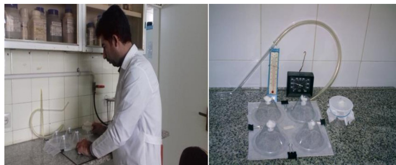
Fig 1. Bioassay test to determine residual efficacy rate of ATSB-treated barrier fence in Markazi district, Qom province, Iran, 2015.

https://doi.org/10.1371/journal.pone.0173558.g001