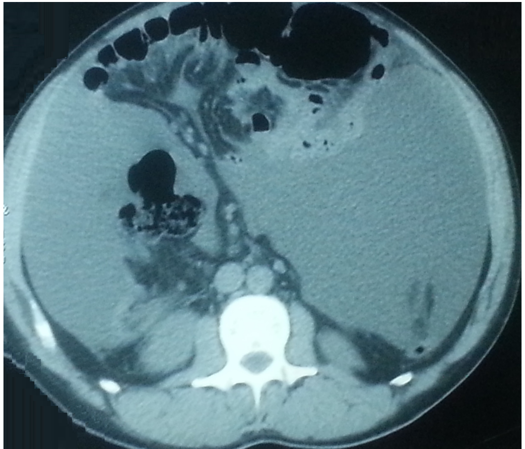
FIGURE 1: Peritoneal effusion with micronodular peritoneal implants in abdominal computed tomography.

Pathohistological examination of the peritoneal nodules showed a well-developed papillary growth pattern without solid or trabecular areas. The papillae were lined by a single layer of uniform cuboidal cells without cytological atypia, covering the fibrovascular core. Very few mitotic figures were seen amongst the tumor cells. There was no evidence of pseudostratification. Only a single focus of microinvasion was present. On immunohistochemical study, the tumor cells were positive for CTK7 (cytokeratin), CTK5/6, CTK19, and calretinin, but they were negative for CTK20 and Cdx2 (caudal-related homeobox transcription factor 2). A diagnosis of WDPMP was made, based on the histomorphology and immunohistochemistry (Figure 2).