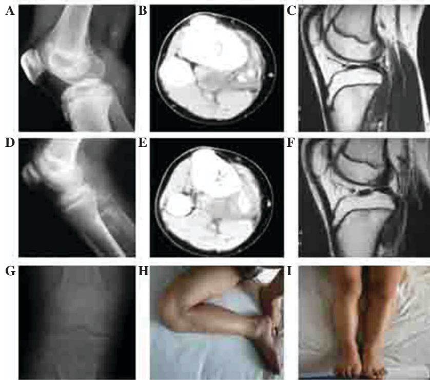
Figure 3. Case 2: Imaging examinations, including (A, D and G) X-ray, (B and E) computed tomography and (C and E) magnetic resonance imaging (MRI). (A-C) A space-occupying lesion in the proximal region of the right tibia, with no intramedullary involvement. (D-F) Radiological changes owing to pre-operative chemotherapy; the mass was well-defined and calcification was detected within it. MRI indicated a smaller volume of tumor. (G) X-ray at the end of 108 months of follow-up showing no local recurrence. (H and I) Normal limb function, as demonstrated by as demonstrated by normal (H) flexion and (I) extension, at the end of the follow-up period.

no metastases or recurrence (Fig. 1G). Normal life activities were recorded until the end of the follow-up time of 37 months (Fig. 1H and I). According to the Musculo-Skeletal Tumor Society (MSTS) functional scoring system, the patient's score was 100% (8).