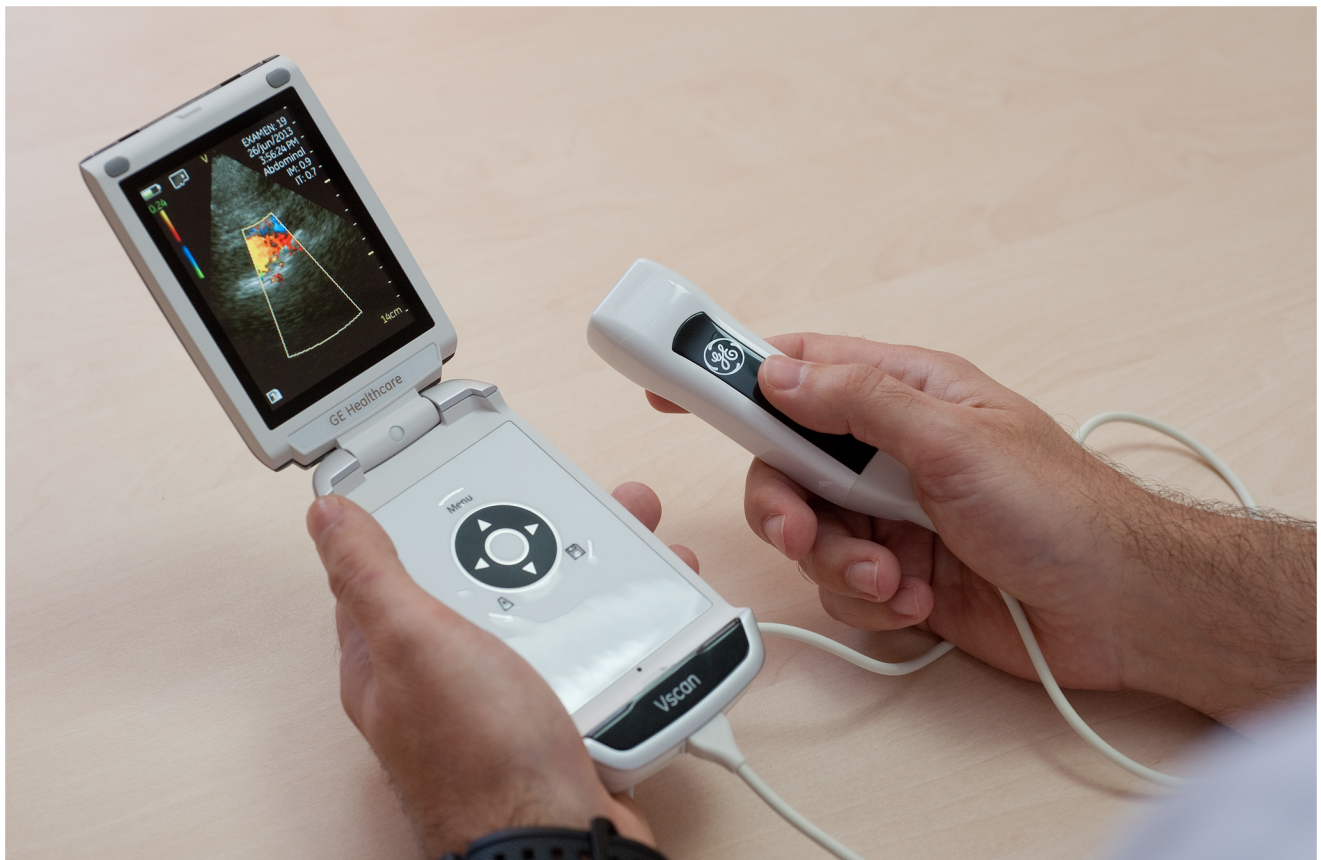
Fig 1. Vscan ® device.

Ultrasound examinations were performed with a hand-held ultrasound device (Vscan ® , General Electric, USA). The device weighs 390 g and measures 135×73×28 mm, and has a screen size of 8.9 cm. It offers two-dimensional grey scale and live color Doppler imaging. The bandwidth ranges from 1.7 to 3.8 MHz and is adjusted automatically (Fig 1).