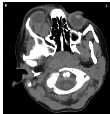
Figure 4. Case 3: Computed tomographic scan showing a right intra-conal lesion, with right upper lid soft-tissue involvement.

Surgical excision is challenging, since orbital lymphangiomas are unencapsulated. Thus, in some cases only partial excision is performed to debulk the lesion and