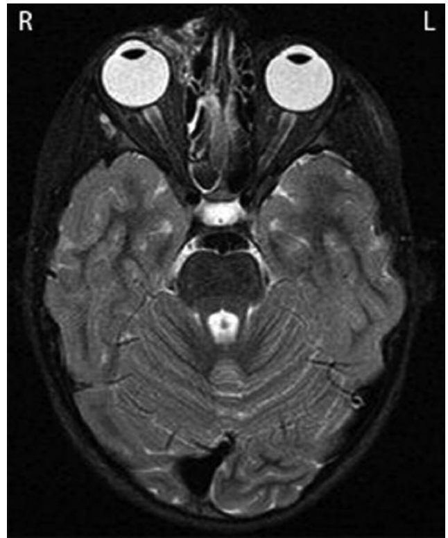
Figure 3. Case 2: T2-Weighted magnetic resonance imaging showing a lesion medial to the right orbit, extending into the right orbit.

Any lesions that are found to have any vascular system connection fall under Type 2 (7).