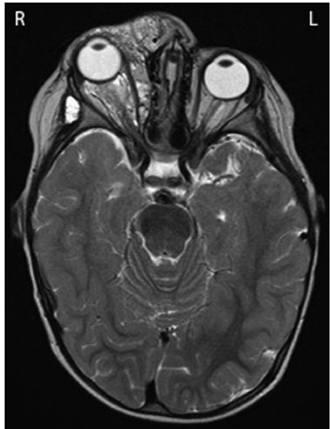
Figure 1. Case 1: T2-Weighted magnetic resonance imaging showing a lesion involving the right upper lid, extending into the extra and intra-conal spaces medially, almost to the orbital apex.

The patient showed a good response to treatment, and extra-ocular muscle restriction, proptosis and upper lid swelling all resolved. Only a small 4-mm fluid-filled cyst remained in the posterior orbit on MRI. The patient has been