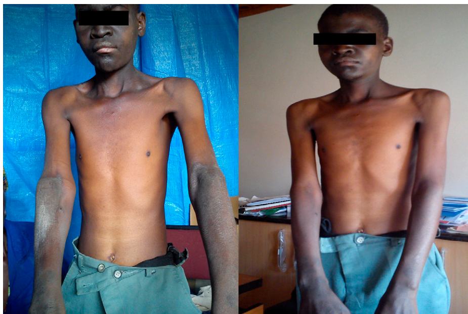
FIGURE 3. Male patient from the Kasese catchment area with pellagra dermatitis of the forearm and neck (left) and after treatment with niacin supplementation (right).

for these extremely impoverished areas. The distribution of the supplements is also an issue as the Kasese clinic serves a very large catchment area and would require great effort in ensuring continual supplementation. Alternative methods for increasing available niacin in the patients' diet are thus important to consider. Three possible solutions have been discussed with the clinicians at the Kasese clinic: fortification, diet diversification, and maize processing with alkaline hydrolysis.