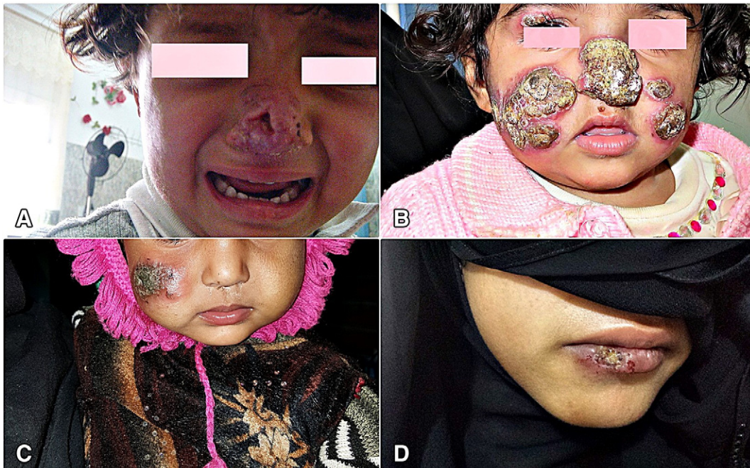
Fig. 1. Yemeni female children with (A) mucocutaneous leishmaniasis (MCL) complicated by stigmatizing nasal perforation, (B) lepromatous diffuse cutaneous leishmaniasis (DCL), (C) giant CL plaque on the right cheek, and (D) destructive MCL ulcer on the lower lip who were treated at the Regional Leishmaniasis Control Center's clinics in Sana'a, the capital city; and Radaa, a district of the Al Baydaa governorate in central Yemen.

Most rural women wear face veils; thus, some of the stigma, especially of facial lesions in uncovered women, is associated with the blame-the-victim idea that if the woman had been modestly covered, she would not have been infected.