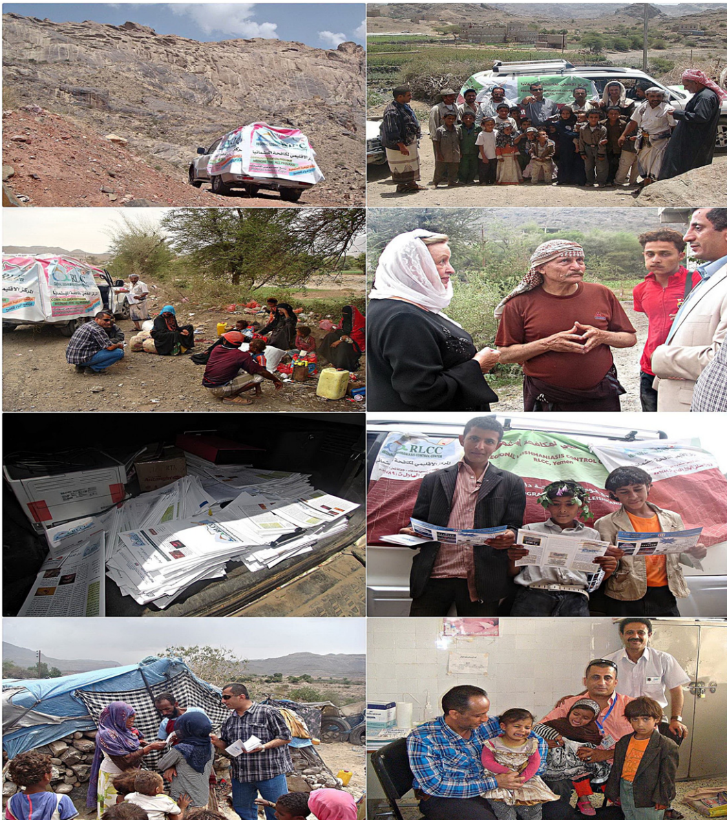
Fig. 5. Eradication of Leishmaniasis from Yemen Project remote field's educational, surveillance, and treatment campaigns to many endemic regions of Yemen.

To confront the dire need for action to implement effective leishmaniasis surveillance and control, my ISD-sponsored community