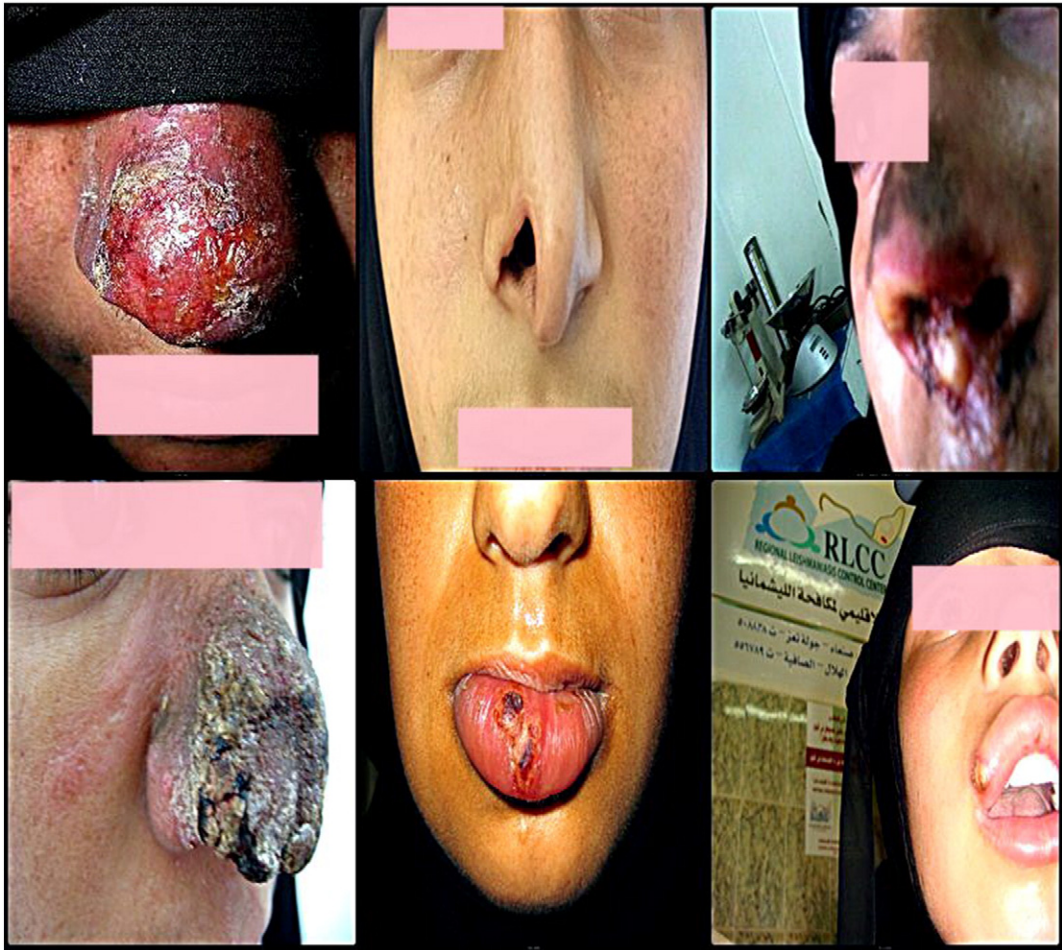
Fig. 2. Aesthetic stigma associated with mucocutaneous leishmaniasis in adult Yemeni females, at the Regional Leishmaniasis Control Center clinics in Yemen.