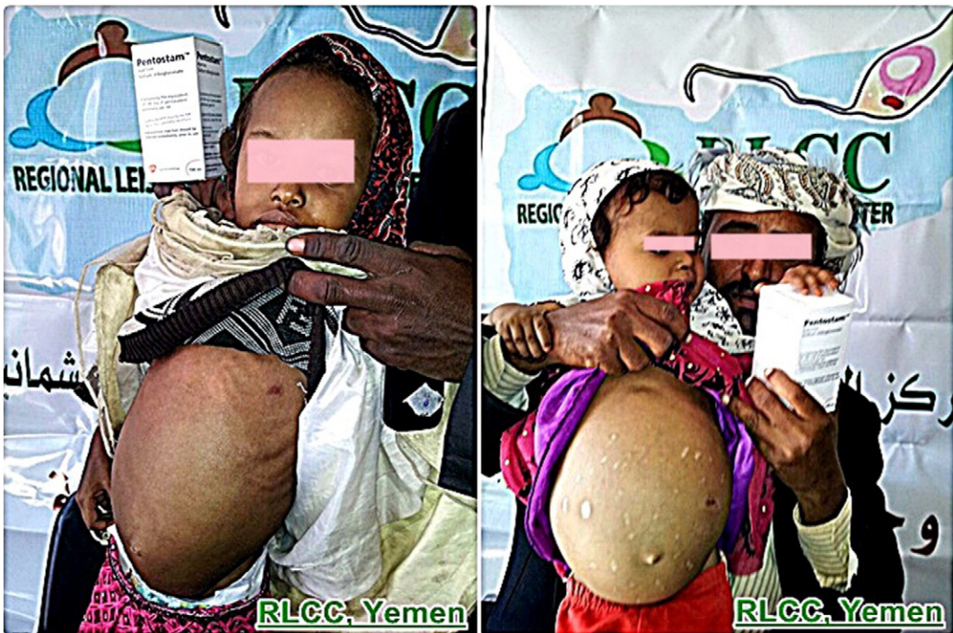
Fig. 3. Two female children with visceral leishmaniasis granted free medicine at the Regional Leishmaniasis Control Center's Hajjah unit at the north of Yemen.