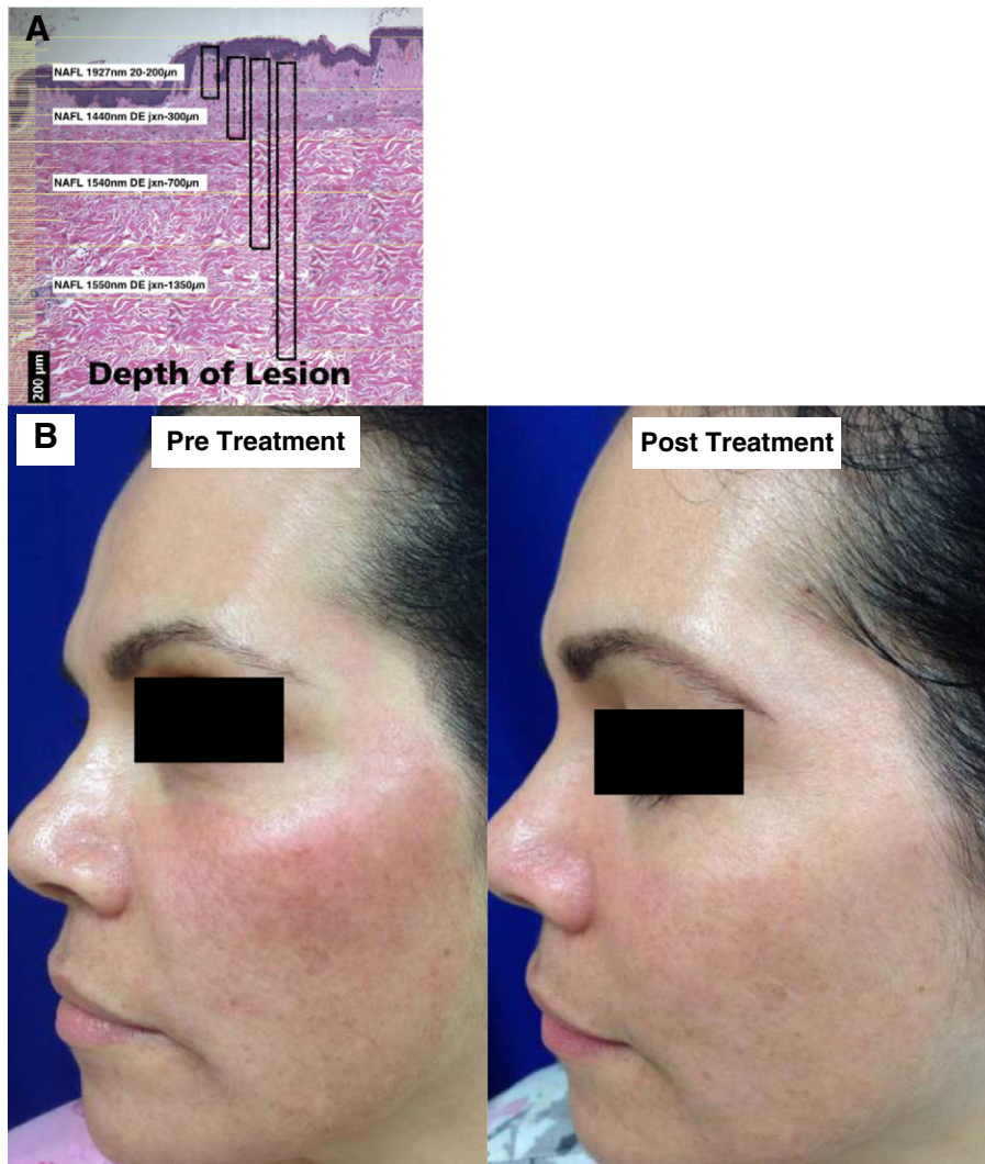
Figure 2. A. Non ablative fractionated laser treatment zones by depth of penetration B. Response to a single treatment of non ablative fractionated 1927 nm laser (Fraxel, Solta, 20mJ/mb, TL 2, Passes 8).

One study used a monopolar RF device to facilitate the drug delivery of phytocomplex of 1% kojic acid in 50 patients who were treated weekly for 6 weeks and evaluated pretreatment, at 1 month, and at 6 months. There was sustained MASI score improvement after 1 month that seemed to continue without adverse effects until the 6-month follow-up visit (Cameli et al., 2014). Fractional RF is a new development in which pins are inserted into the skin, which results in fractional treatments that range from nonablative to minimally ablative. The pins vary in depth and density and some are even