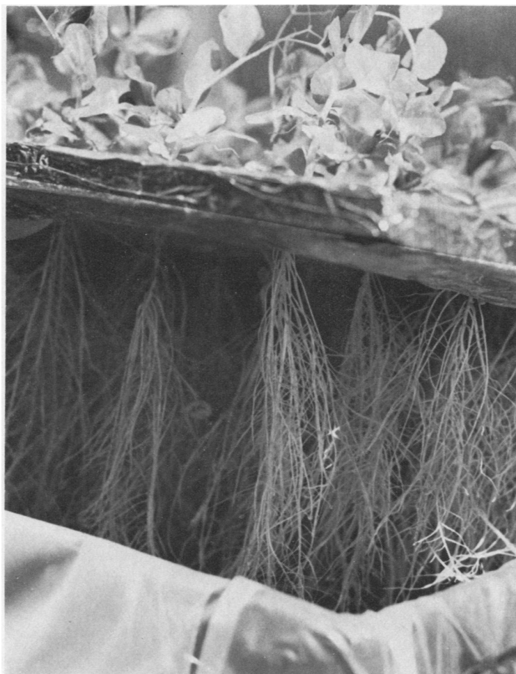
FIG. 3. View looking into the aeroponics box, showing the root systems of pea plants at about 3 weeks from planting. This lot of plants was not inoculated with Rhizobium .