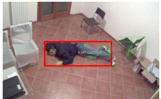
Figure 3: Example of fall detection software

Healthcare services offices procure quiet spectators (in some cases called persistent sitters) or dole out staff to screen patients at hazard for falls or on suicide watch, and the individuals who are befuddled or disturbed. Dissimilar to private-obligation individual care associates, a patient onlooker's sole duty is to advise staff when the patient takes part in conceivably self-damaging conduct, for example, getting up without help or hauling out tubes.