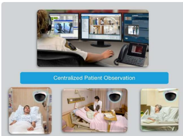
Figure 4: Monitoring station for multiple locations with a hospital

Onlookers by and large get time-based compensation, an unreimbursed cost. Some human services offices must request that the patient's family give sitters, forcing a weight for working relatives. Healthcare services associations can bring down the expenses of patient perception utilising top notch (HD) video reconnaissance and two-way correspondences. With the perception arrangement, prepared staff in a focal operations focus can watch various patients over the office's current system, rapidly alarming staff when intercession is required. Figure 4 shows the centralised patient observation setup. Healthcare industry can greatly benefit from cloud-based surveillance, especially from video analytics software such as motion analysis. The authors Lee, and Chung, 2012 [24] developed an algorithm capable of detecting falls of patients in healthcare institutions and removing shadows from objects thus greatly increasing false detection. Such a system of detection can be implemented to monitor patients movement in real-time by automatically notifying hospital staff of unfortunate event such as falling or undesired movement.