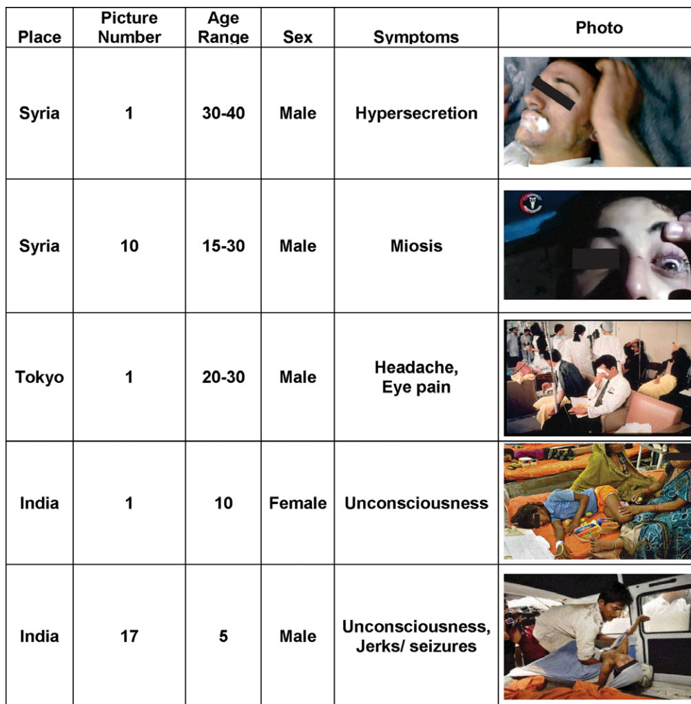
Figure 2 Severity of signs and symptoms of organophosphate and nerve agent poisoning by incident.

number of lives lost. Tokyo is also a large metropolitan city, with easy and fast access to healthcare and medications, whereas the events in Syria and India were in more rural areas that required travel to seek medical attention.