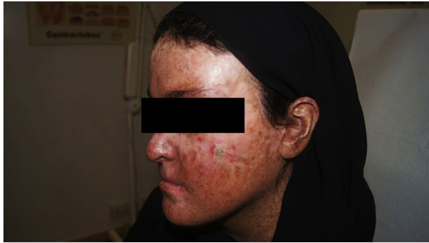
Figure 1 Freckle-like brown macules and erythematous, indurated plaques with adherent scales.

freckle-like brown macules on her face, neck, and upper chest (Figure 2). Moreover, she had both reticulated hyper- and hypopigmented macules over upper and lower limbs, especially over the dorsa of her hands and feet (Figure 3). Two scars were noted consisting of a surgical scar over the base of the neck and a trauma scar over her left cheek. Scalp examination revealed a 2×1 cm, hairless plaque and decreased hair density all over her scalp (Figure 4). No mucosal lesions, facial telangiectasia, or palmer pits were noted. Joint swelling and tenderness were not appreciated.