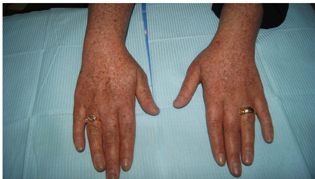
Figure 3 Reticulate hyperpigmented and hypopigmented macules on dorsa of hands.

For the histopathological examination, biopsies were taken from both hypo- and hyperpigmented lesions (Figures 5 and 6). Hyperpigmented lesions showed an abundance of melanin pigment in keratinocytes and melanocytes with the presence of a few scattered melanophages in hyperpigmented macules. In contrast, hypopigmented lesions showed a reduction in melanin and number of melanocytes as determined by Melan A