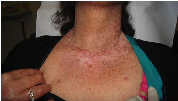
Figure 2 Reticulate hyperpigmented and hypopigmented macules on neck and upper chest.