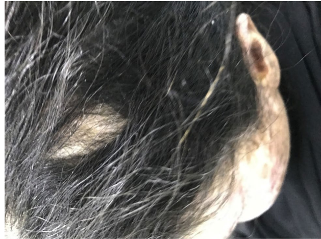
Figure 4 Discoid-like patch over the scalp.

For the histopathological examination, biopsies were taken from both hypo- and hyperpigmented lesions (Figures 5 and 6). Hyperpigmented lesions showed an abundance of melanin pigment in keratinocytes and melanocytes with the presence of a few scattered melanophages in hyperpigmented macules. In contrast, hypopigmented lesions showed a reduction in melanin and number of melanocytes as determined by Melan A