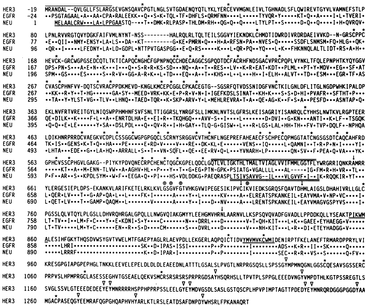
FIG. 3. Protein sequence comparison between members of the human EGF-R family. Sequences are displayed using the single-letter code, and identical residues are denoted with dots. Gaps were introduced for optimal alignment and are shown by a dash. Signal sequences are bounded by single lines, transmembrane domains are bounded by double lines, and sequences used to derive the probes and primers (ARRD1, ARRD2) used for cloning are underlined. Cysteine residues are marked with stars, the potential ATP-binding site is shown with circled crosses (Gly-Xaa-Gly-Xaa-Xaa-Gly beginning at residue 697 and Lys-723), COOH-terminal tyrosines are denoted with open triangles, and additional residues of HER3 referred to in the text are marked with arrows (Ala-657, Cys-721, His-740, and Asn-815). Neu, HER2/neu.

sion of HER3 in cells lacking EGF-R will allow us to determine whether EGF, TGF- \alpha , or amphiregulin interact with this putative receptor.