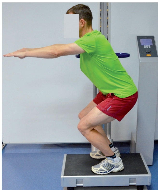
FIG. 1. Whole-body vibrations.

The influence of a 4-week whole-body vibration training was assessed. Participants performed the exercises 3 times a week (Monday, Wednesday, and Friday); the program consisted of sixteen exercises sessions [13]. Whole-body vibration training was carried out on a vibration platform (Fitvibe 600, Gymna Uniphy N.V.). The test participant was in a static position during the exercises. Briefly, each subject was asked to stand on the platform, loading his feet uniformly, with the knee and hip joints bent at 90° and the upper extremities stretched horizontally forwards (fig. 1). The range of flexion of the hip and knee joints was measured with a goniometer. Krol et al. [2] reported significantly increased bioelectrical activity of the lower extremity muscles of subjects standing with the knee joints bent at 90°. The above mentioned position is quite safe as knee flexion reduces the amount of vibration that reaches the head [28]. The exercise and rest times were adapted from the procedures used by other researchers [9,29]. A single vibration session in the study was a series of 5 static exercises on a vibration platform for 1 min, followed by a 1 min break. Each participant performed few static stretch exercises of quadriceps femoris and gastrocnemius muscles before each training session.