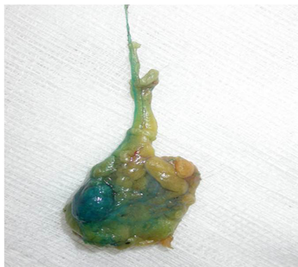
Figure 1 Identification of “hot” and blue nodes in a surgical specimen of sentinel lymph node biopsy.

Surgical criteria for SLN(s) include the identification of all “hot” and blue nodes as previously described (Figure 1). 18 The SLN(s) was always assessed by IC as well as FS analysis and IHC. During SLN assessment in the laboratory the patient was submitted to the scheduled definitive operation for BC such as wide local excision or mastectomy with or without reconstruction. In case of macrometastatic disease in the