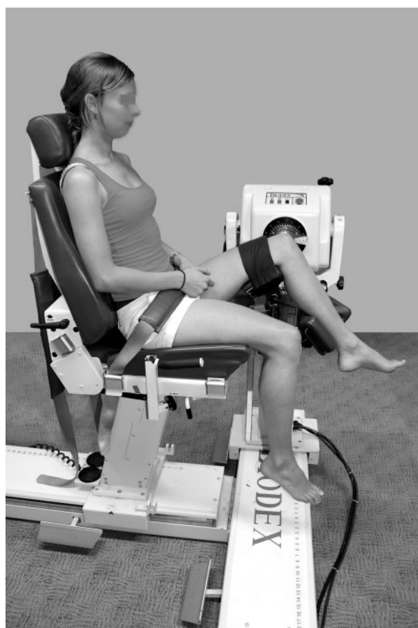
Figure 2 Upright-sitting position. Photograph reprinted with permission.

differed (Fig. 2) as all participants relaxed into the back-rest of the Biodex.