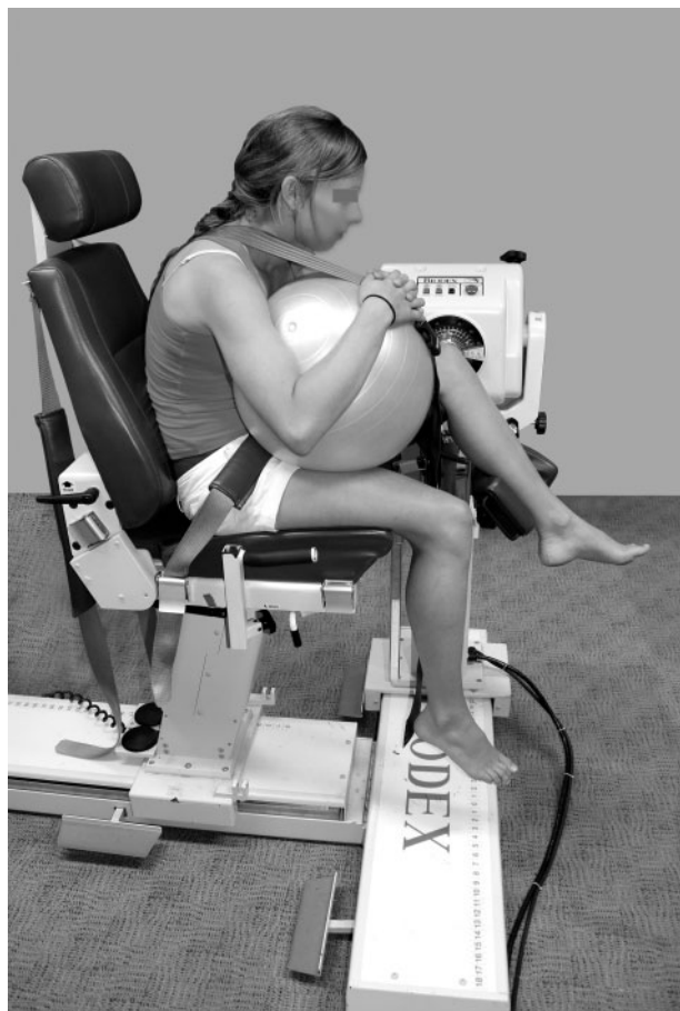
Figure 1 Slump-sitting position. Photograph reprinted with permission.