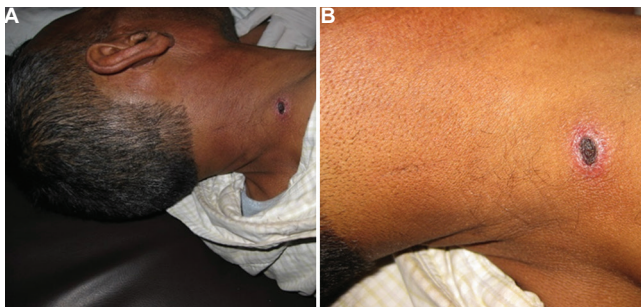
Fig. 2. Eschars in patients with scrub typhus. (A) An eschar on the neck of a patient with scrub typhus. (B) A close up of the eschar shows the typical cigarette burn appearance of an eschar.

On laboratory evaluation, the leucocyte count was normal in more than half of cases and elevated in one-third of patients (Table II). The most common laboratory abnormalities were elevation of transaminases, thrombocytopenia, hypoalbuminaemia, while elevated total bilirubin level and serum creatinine were seen in nearly half of patients (Table II). Due to lack of a productive cough, sputum examinations could not be done in patients. The X-rays revealed bilateral interstitial patterns (with reticulonodular and ground-glass opacities) initially, extensive air-space consolidation in patients with ARDS (Fig. 3)