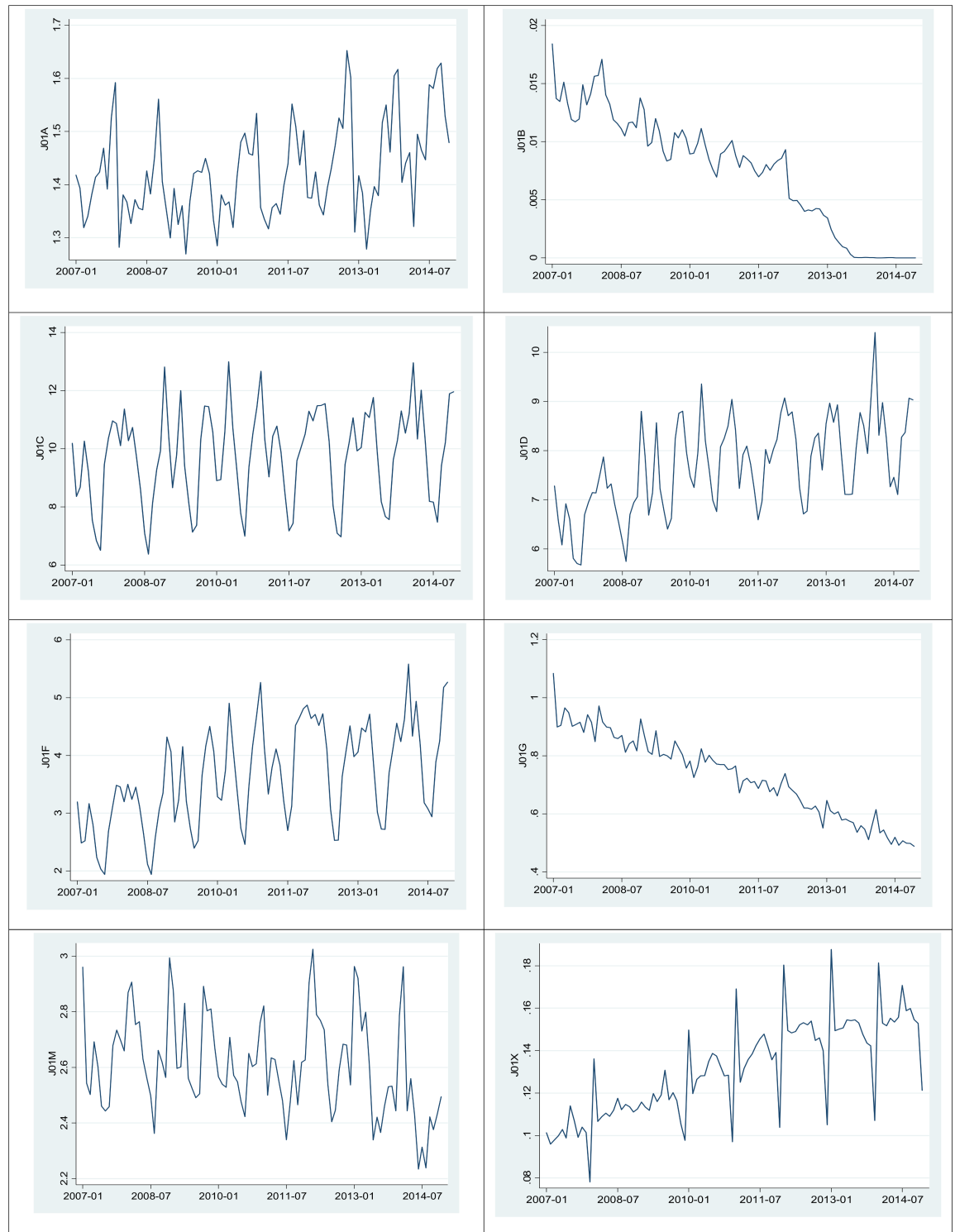
Fig 2. Antibiotic use from 2007 to 2014 based on the third level of ATC (the unit of Y is DID/month, where DID is the daily defined dose/1,000 inhabitants/day, based on WHO-defined daily doses). J01A: tetracyclines, J01B: amphenicols, J01C: beta-lactam antibacterials, penicillins, J01D: other beta-lactam antibacterials, J01F: macrolides, lincosamides and streptogramins, J01G: aminoglycoside antibacterials, J01M: quinolone antibacterials, J01X: other antibacterials

https://doi.org/10.1371/journal.pone.0177435.g002