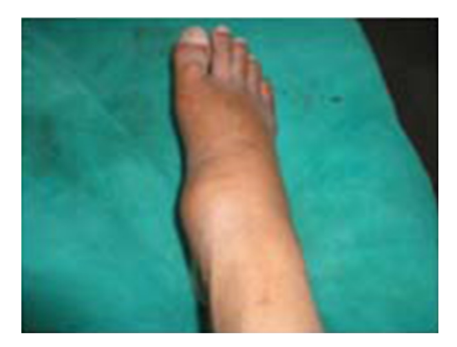
Fig. 1. Clinical appearance of the injury.