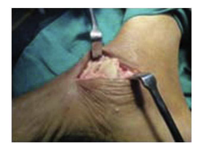
Fig. 4. Peroperative photograph of the displaced navicular.

The bones of the midfoot fit snugly against one another and are shaped to form the transverse and longitudinal arches. The medial longitudinal column consists of the talus, the navicular, the three cuneiforms and the corresponding three metatarsals. The lateral column consists of the calcaneus, the cuboid and the corresponding two metatarsals. The navicular is the keystone of the medial longitudinal arch, and is rigidly stabilized by an extensive network of