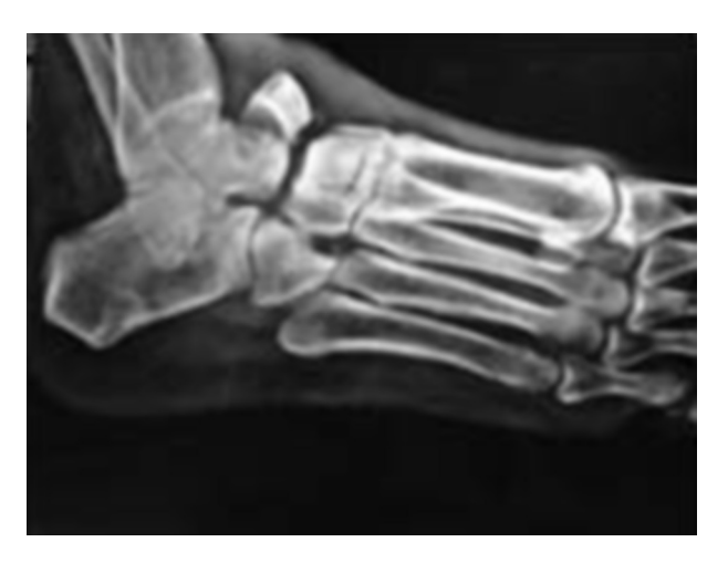
Fig. 2. Preoperative radiograph showing a displaced navicular.

ligamentous structures, which allows the navicular to dislocate without fracture.