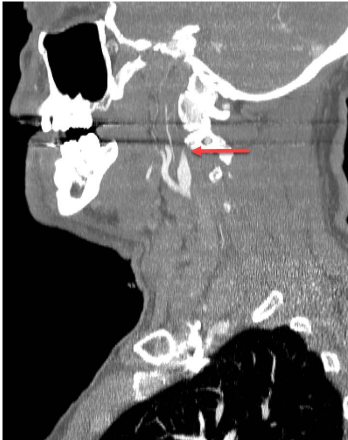
Figure 2: 63 year old male with internal carotid artery dissection.

FINDINGS: A single sagittal slice from CT angiogram (arterial phase post-contrast images) on a different patient than that in the test case demonstrates tapering of a dissected internal carotid artery. This is the classical "flame-shaped" appearance of a carotid artery dissection (arrow).